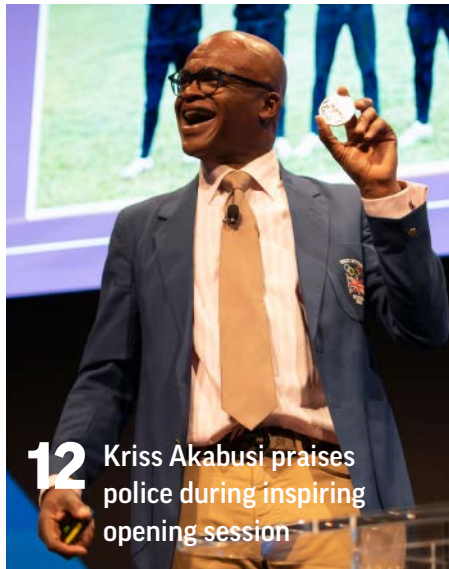
12 Kris Akabusi praises police during inspiring opening session