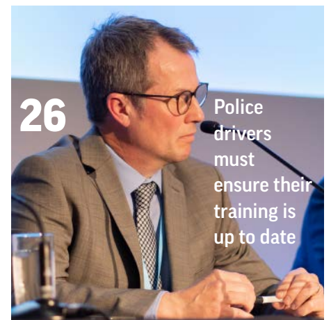
26 Police drivers must ensure their training is up to date