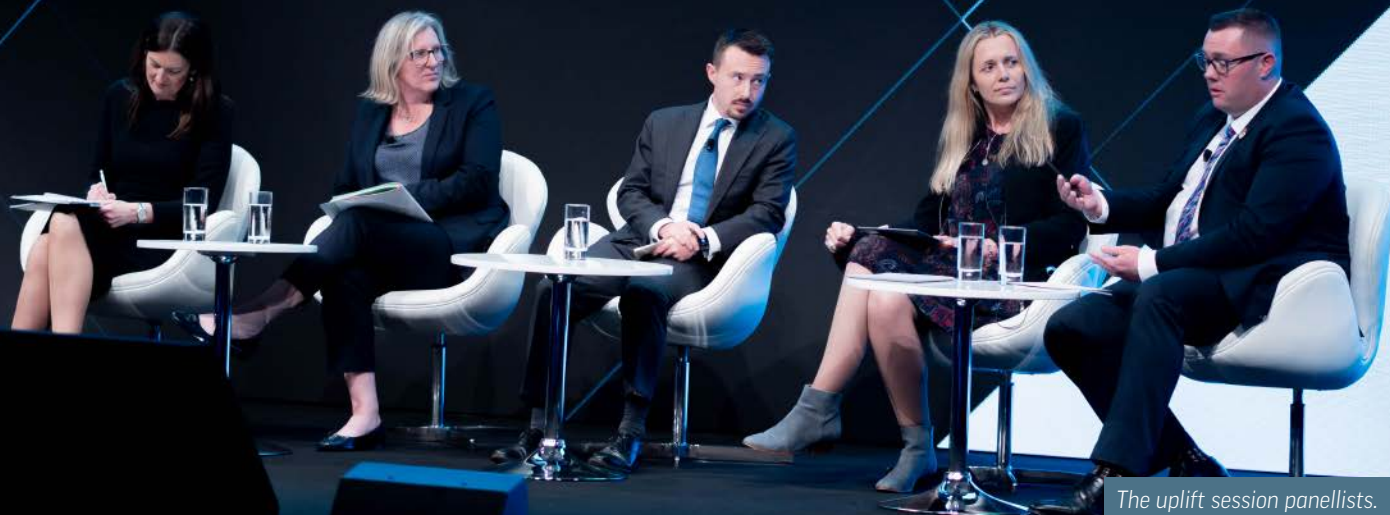
The uplift session panellists.