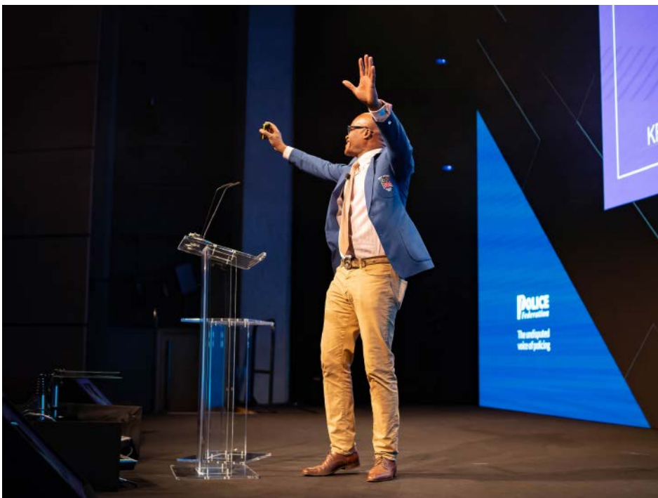
Kriss Akabusi delivering his highly animated, entertaining and inspirational session.