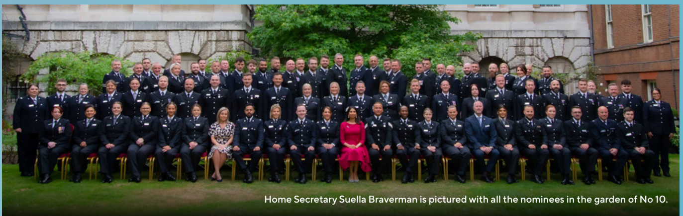
Home Secretary Suella Braverman is pictured with all the nominees in the garden of No 10.