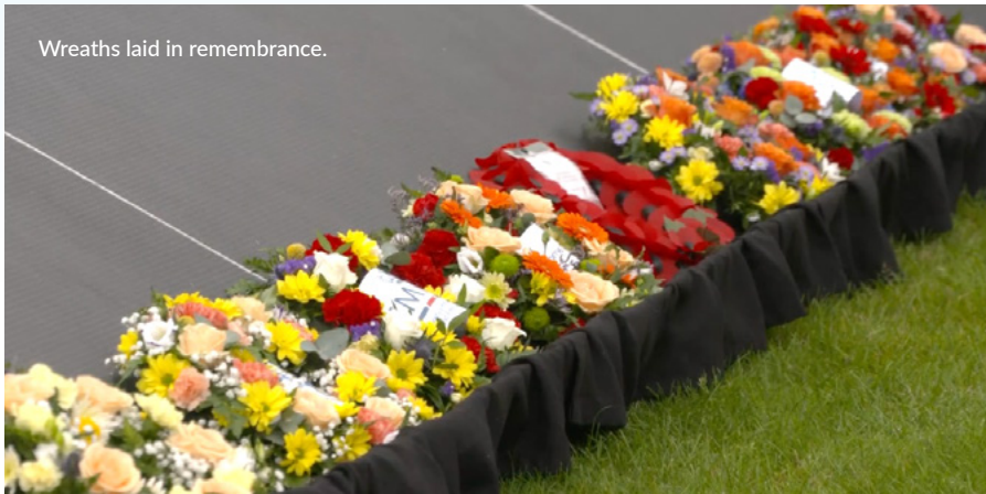
Wreaths laid in remembrance.