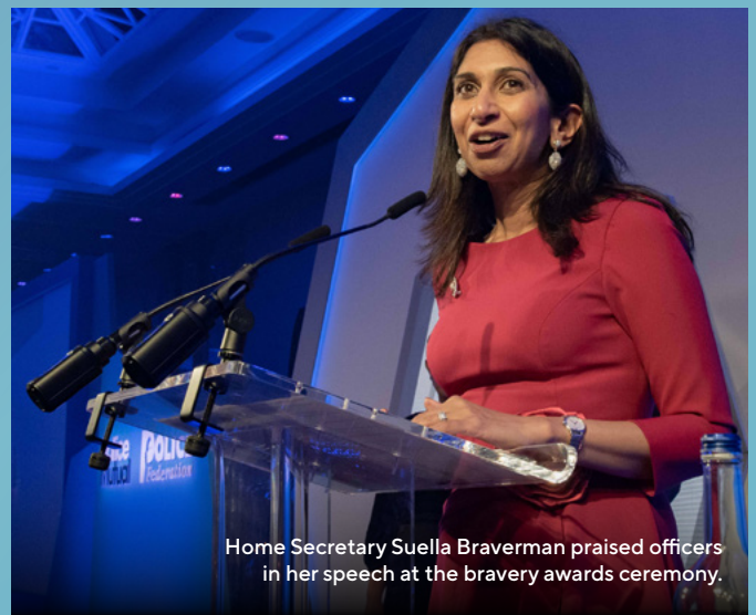
Home Secretary Suella Braverman praised officers in her speech at the bravery awards ceremony.