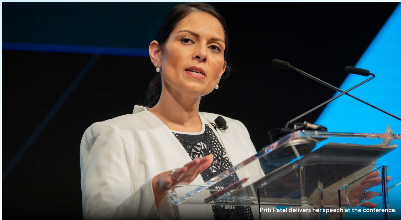
Priti Patel delivers her speech at the conference.