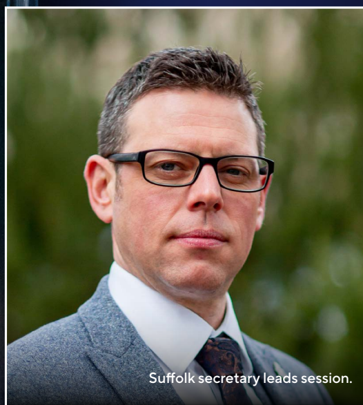
Suffolk secretary leads session.