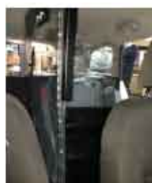
Work in progress on new prisoner bubble.