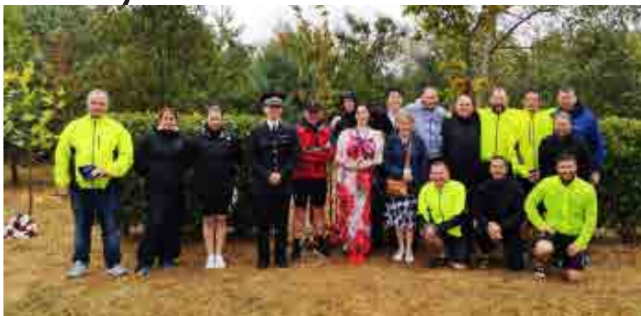
Gathered at the North Wales tree on The Beat at the arboretum after last year's Police Unity Tour.

We are keen to invite cyclists from across the organisation who wish to experience the event and support fund-raising efforts, to join the team. While we strive to be as inclusive as we can, the first day in particular, covering approximately 130 miles with 7-8,000 ft of ascent, is tough and requires good levels of fitness and experience of riding in a group. The second day, during which we ride with the 'Welsh