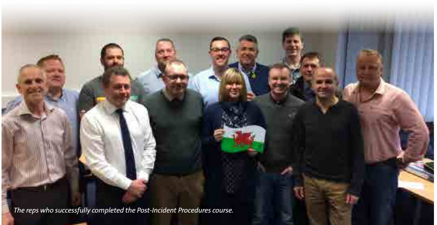
The reps who successfully completed the Post-Incident Procedures course.

The service is provided by personal nurse advisers who are all very experienced, registered nurses. The service has been well used in 2018 (we only know the numbers, the service is completely confidential) and