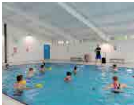
The Police Treatment Centres.

A total of 68 North Wales Police officers (three retired) attended the Police Treatment Centres (PTCs) in 2018. The PTC is an amazing facility, ensuring injured officers have the best possible chance of recovery from injuries sustained both on and off duty. Attendance at the PTC is classed as duty time, and if you don't currently pay into the PTC, please get in touch with the Federation office for more details.