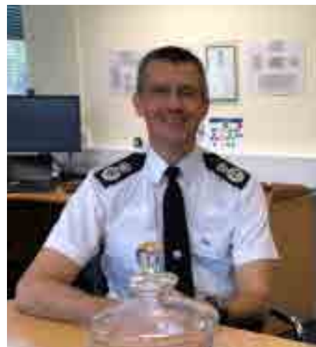
New Chief Constable Carl Foulkes.