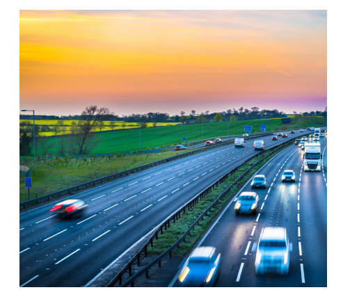
BLOG The toll of policing our roads

Thank you to all who have supported our messaging this month – we shared some truly extraordinary stories and videos.