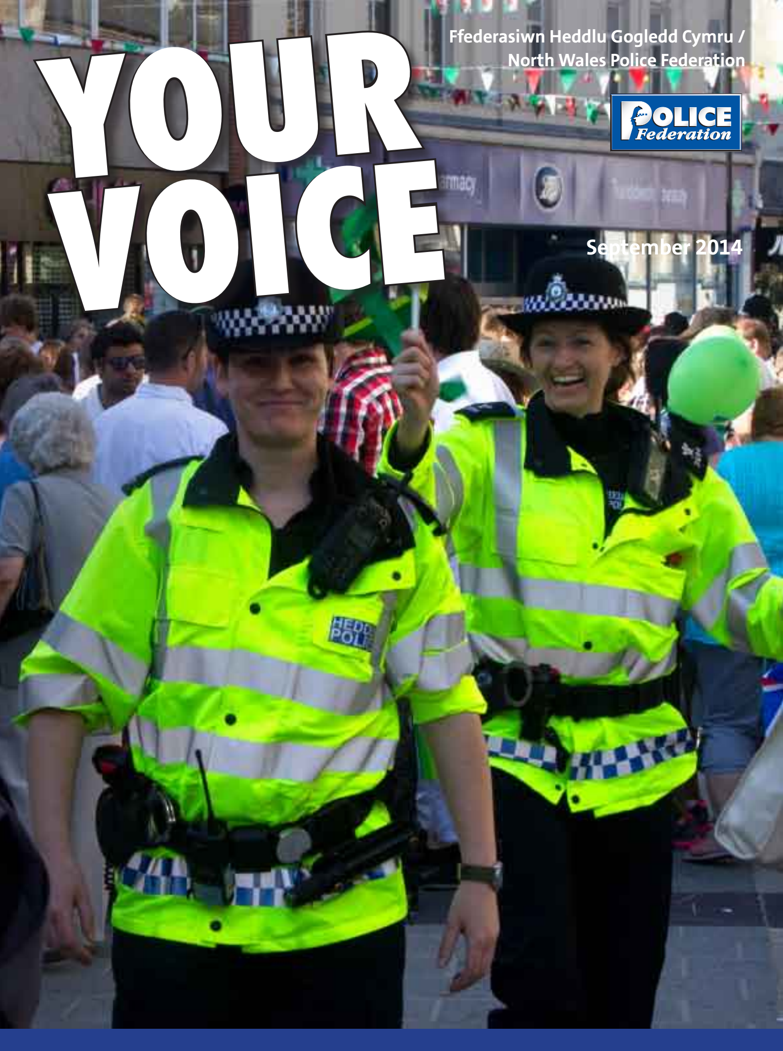
Representing • Negotiating • Influencing