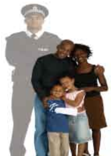
For more information about the Charity visit: <a href="https://www.thepolicetreatmentcentres.org">www.thepolicetreatmentcentres.org</a>

To sign up to begin donating contact Payroll