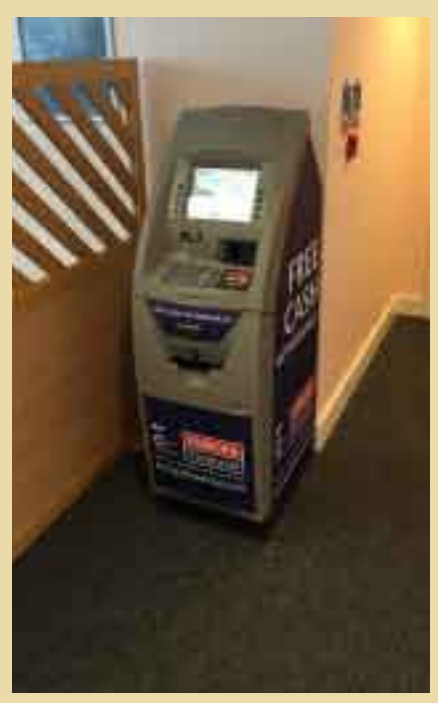
You might have noticed something new in the canteen in St Asaph DHQ. The new ATM, provided by Police

The new ATM, provided by Police Mutual, is now up and running and you won't be charged a fee for using it.