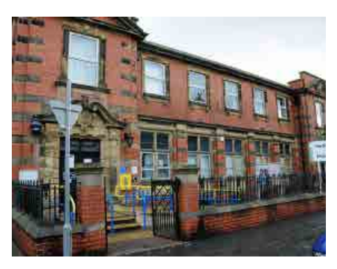
End of an era.

But things change and in 2004 the Divisional Headquarters re-located to a new purpose-built facility at St Asaph. The former building was recently deemed no longer fit for purpose with investment not cost-effective and so a new-build was recommended. There were mixed feelings about this decision, with many officers having fond memories of the old station.