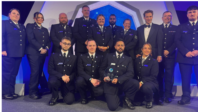
Overall Winners: West Midlands Police