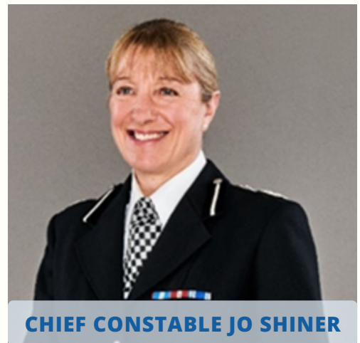
CHIEF CONSTABLE JO SHINER

Furthermore, our road networks are regularly exploited for criminal gain, and it is imperative the way in which we police our roads also tackles and disrupts this criminality.