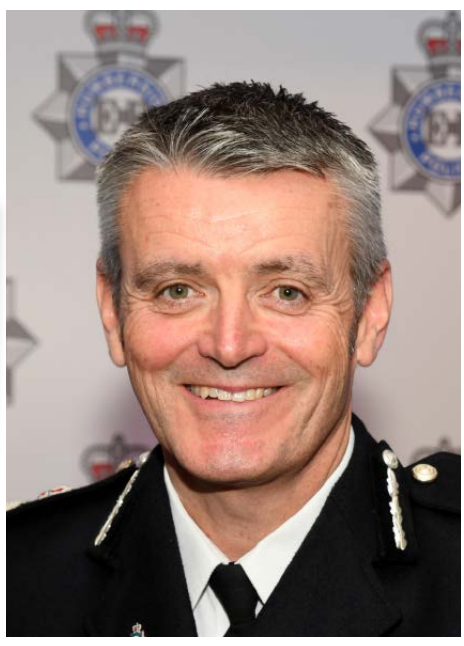
Humberside Chief Constable Lee Freeman.

Humberside Chief Constable Lee Freeman asked the public to work with officers in an attempt to make enforcing the Government's measures to stop the spread of coronavirus easier for all concerned.