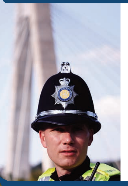
The officer was at risk of the instigation of the Police (Performance) Regulations 2008

...the legal bill of £6,028 was settled by the PFEW