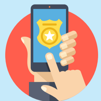
MOBILE PHONE COVER