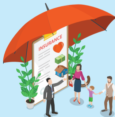
SICK PAY BENEFIT