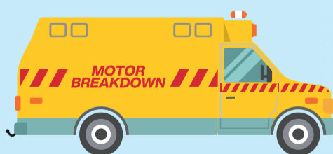
UK & EUROPE MOTOR BREAKDOWN

FOR DETAILS HOW TO JOIN CONTACT THE FEDERATION OFFICE