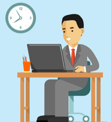
UNSOCIAL HOURS BENEFIT