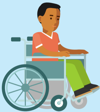
PERMANENT TOTAL DISABLEMENT