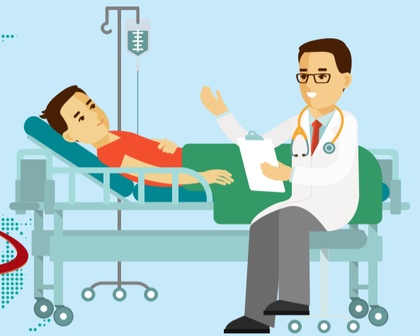
CRITICAL ILLNESS £15,000