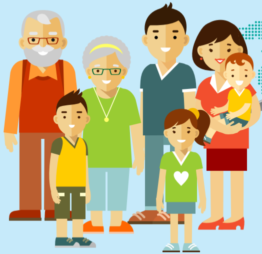
LIFE INSURANCE £120,000