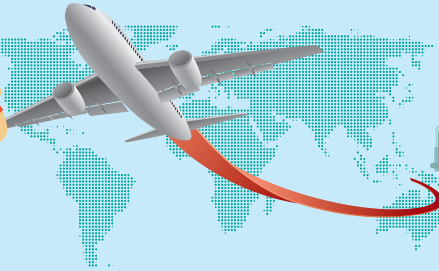
WORLDWIDE TRAVEL INSURANCE