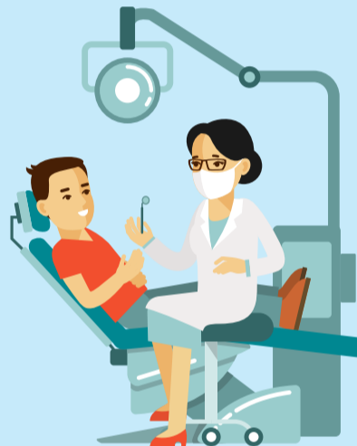
DENTAL INJURY & EMERGENCY