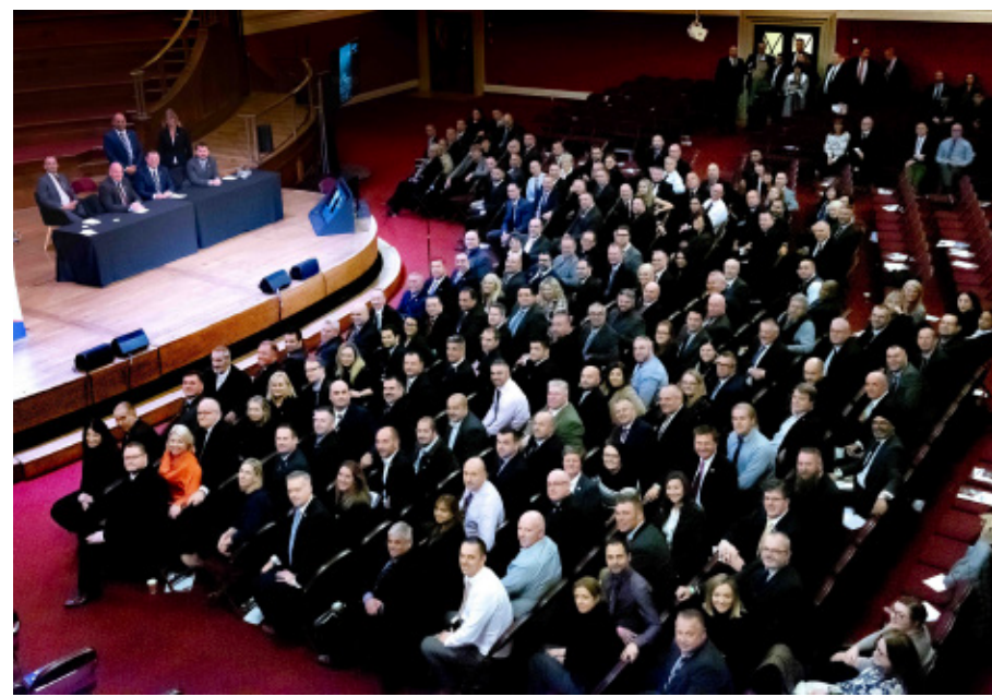
Officers at the centenary event re-staged the 1919 photo.