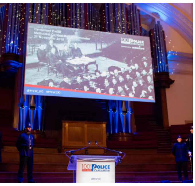
A backdrop to the stage showed a photo taken at the Federation's first meeting at Central Hall in 1919.

He said: "The Fed reps of 100 years ago built the very foundations of our organisation. We are now building the legacy. Together, united, we will continue to do the very best for those we represent: our colleagues and our members who deserve nothing less."