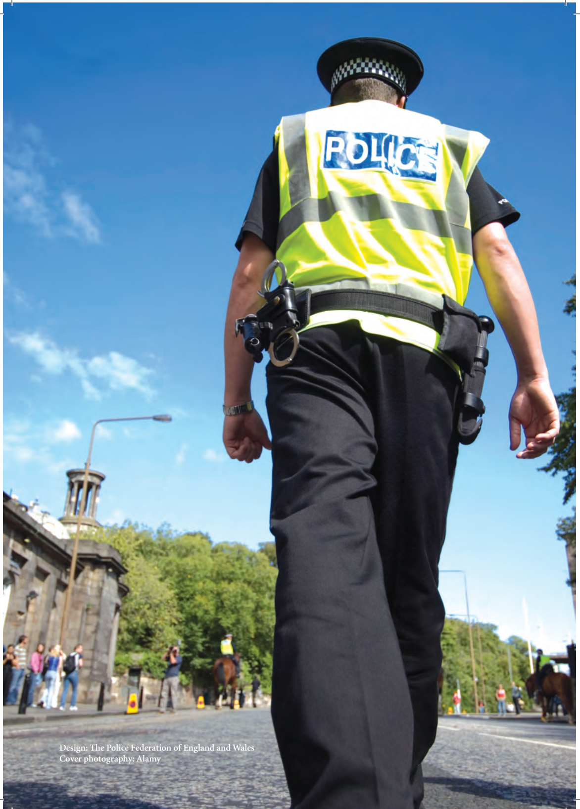
Design: The Police Federation of England and Wales