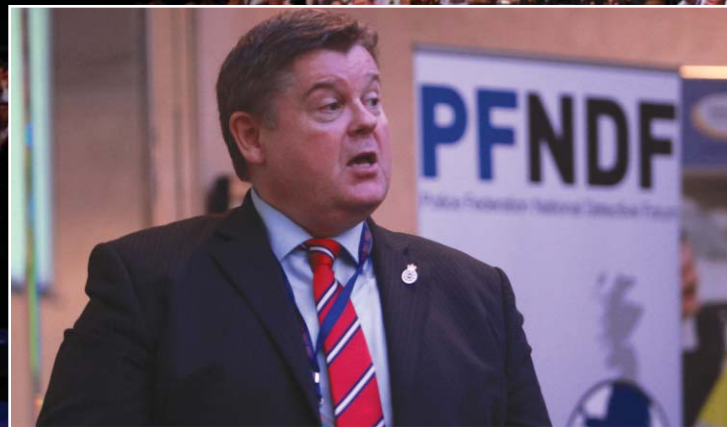
The government's failure to recognise the important role of the detective highlighted during the PFNDF session