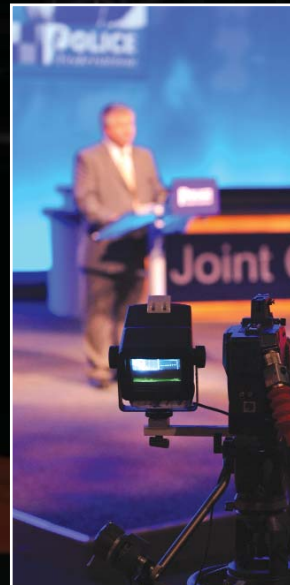
Media coverage was again in the spotlight with Sky and the BBC broadcasting speeches by the chairman and Shadow Home Secretary