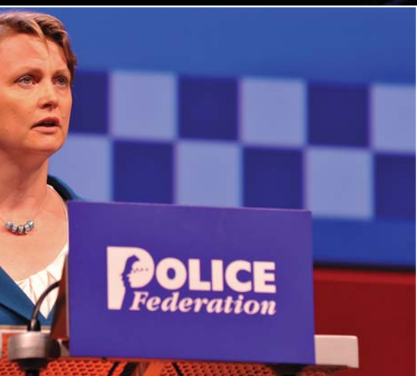
Yvette Cooper accused the government of using officers as "huge risks" with the fight against crime