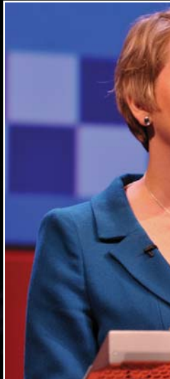
Shadow Home Secretary "punch bags" and taking