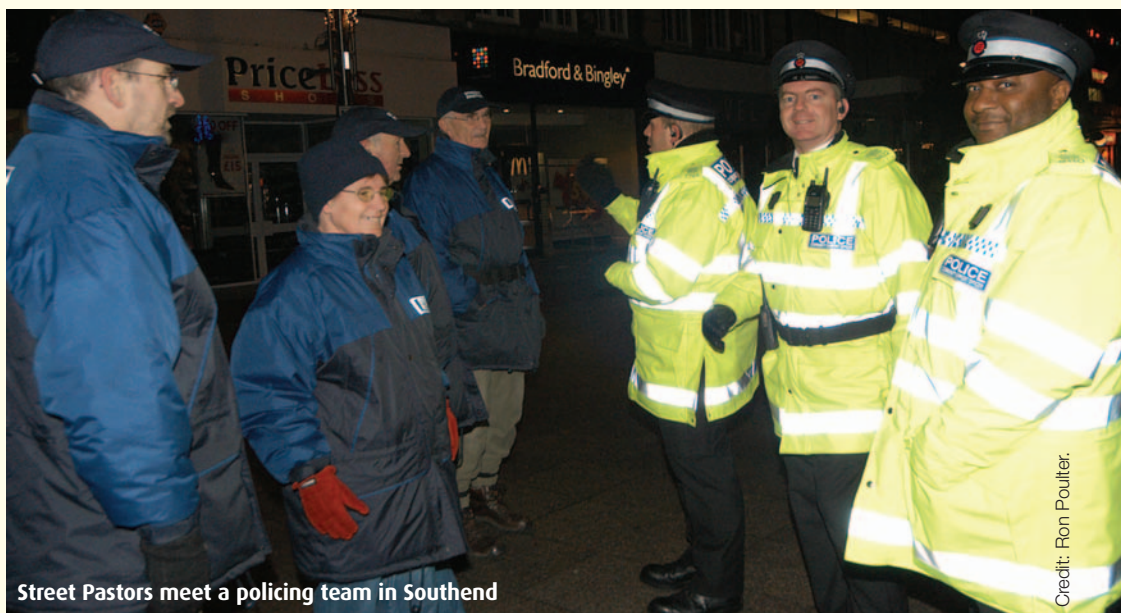
Street Pastors meet a policing team in Southend

So, on Christmas Eve, like any other Friday or Saturday night, the Pastors of Southend will be out in