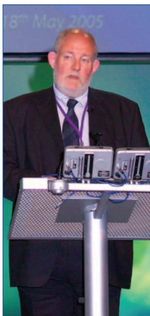
Charles Clarke, Home Secretary: Totally committed to office of constable

The Federation called for reassurances from Home Secretary Charles Clarke that he would not replace police officers with community support officers or axe the office of constable.