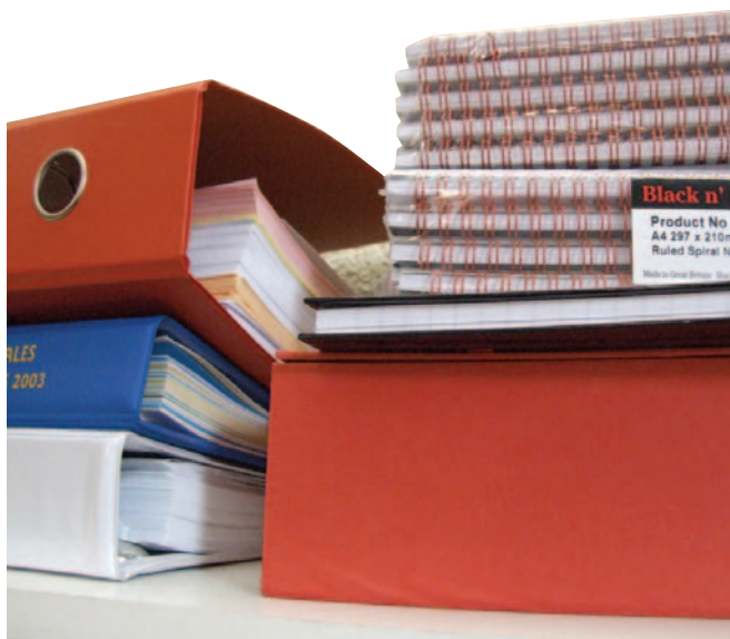
Home Office should show benefit of bureaucracy

In response to a question about increasing bureaucracy caused by the Home Office, Sir