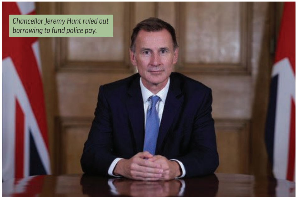
Chancellor Jeremy Hunt ruled out borrowing to fund police pay.

Chancellor Jeremy Hunt told MPs it was “important to deliver on the Prime Minister’s