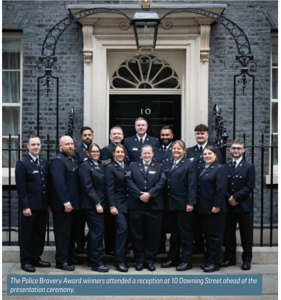
The Police Bravery Award winners attended a reception at 10 Downing Street ahead of the presentation ceremony.

"I know they didn't get the outcome they wanted that day but they all did their very best. The bravery awards showcases all that is good about policing, giving us an opportunity to appreciate the work of our officers who put their lives on the line as they serve the public."