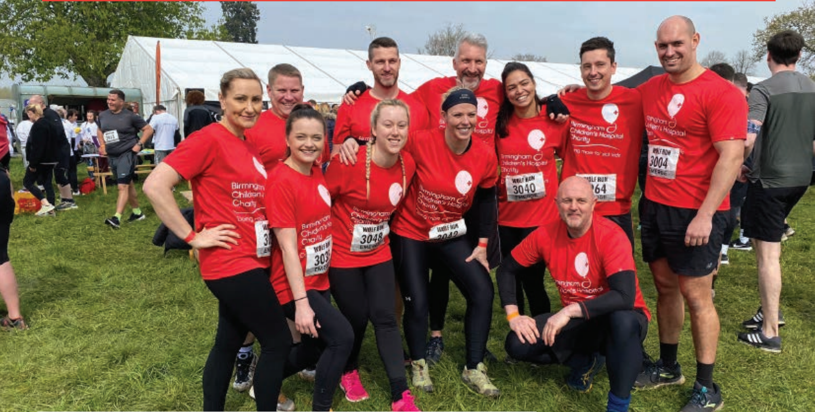
The fund-raising runners.