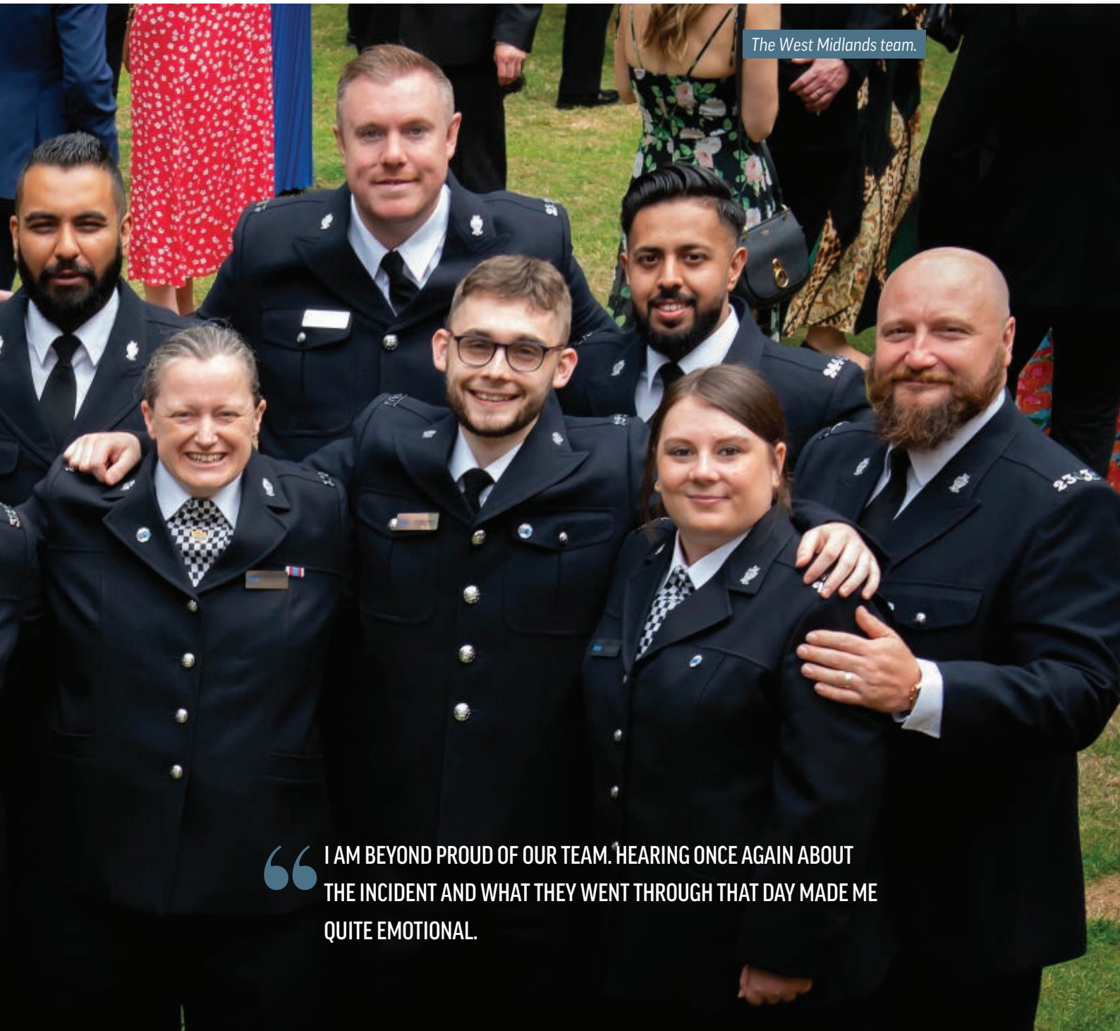
The West Midlands team.

“ I AM BEYOND PROUD OF OUR TEAM. HEARING ONCE AGAIN ABOUT THE INCIDENT AND WHAT THEY WENT THROUGH THAT DAY MADE ME QUITE EMOTIONAL.