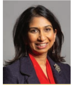
Home Secretary Suella Braverman.

"Some community leaders have got concerns and I think in those cases we have to explain the use of the tactic better because the media narrative has warped the debate and I don't think they are getting the truth."