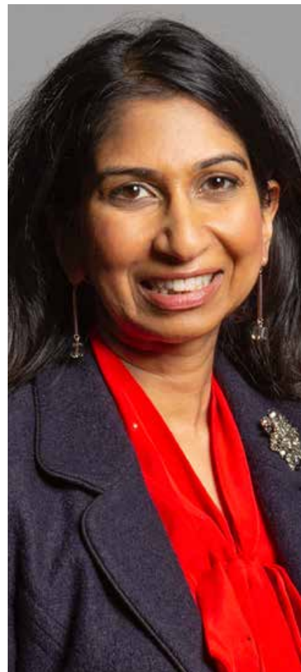
Home Secretary Suella Braverman.

The West Midlands has the highest rate of knife crime in the country and has seen a