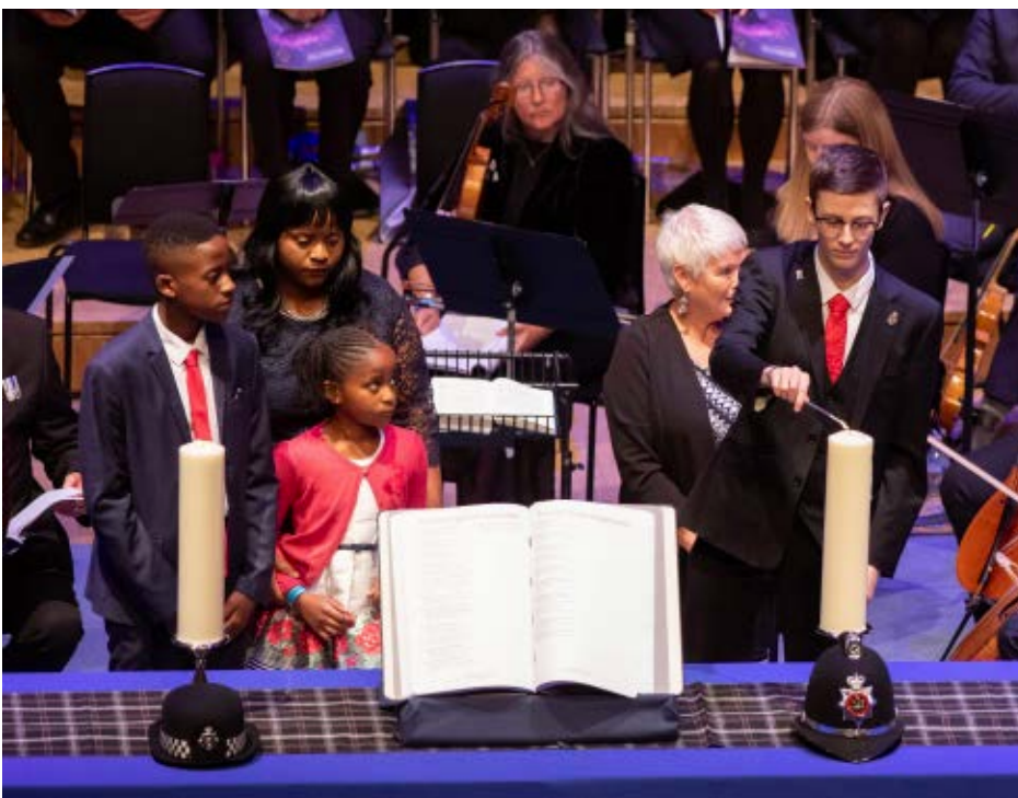
Lighting the candles of remembrance.

There was silence as petals of remembrance, representing all who have lost their lives, descended from the gallery as the orchestra played 'Abide With Me' and the Last Post was sounded.