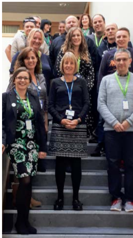
The Mental Health First Aid instructors.

"Every day I have contact with officers who are dealing with mental health issues themselves and the reality is that most of this harm is not being caused by the horrendous sights and experiences we can have as police officers but by the treatment of our own by our own. I am really happy to be involved in any initiative that seeks to address this and to raise understanding and awareness."