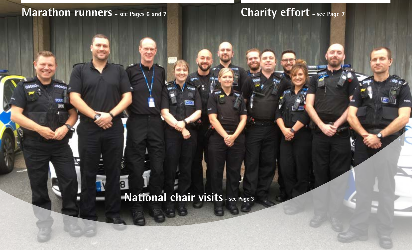
National chair visits – see Page 3