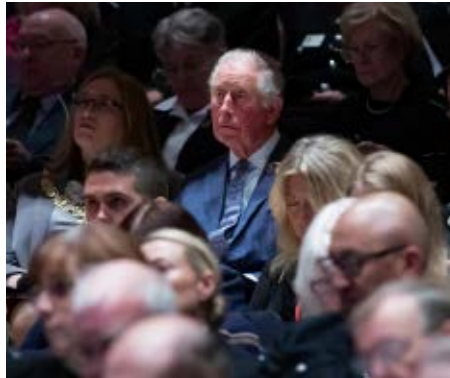
HRH The Prince of Wales joins the congregation at the memorial service.

Scotland's First Minister Nicola Sturgeon and more than 40 chief constables were