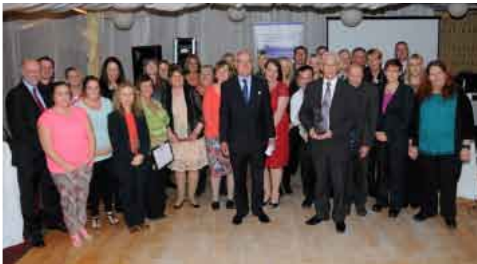
Award-winners at the PCC's Awards Ceremony.