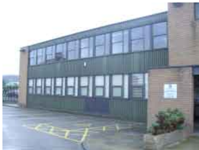
The new base for patrol officers at Sector House.

Dedicated policing for Llandudno began in the 1850s when the Town Commissioners, the predecessors of Llandudno Town Council, appointed a Town Constable.