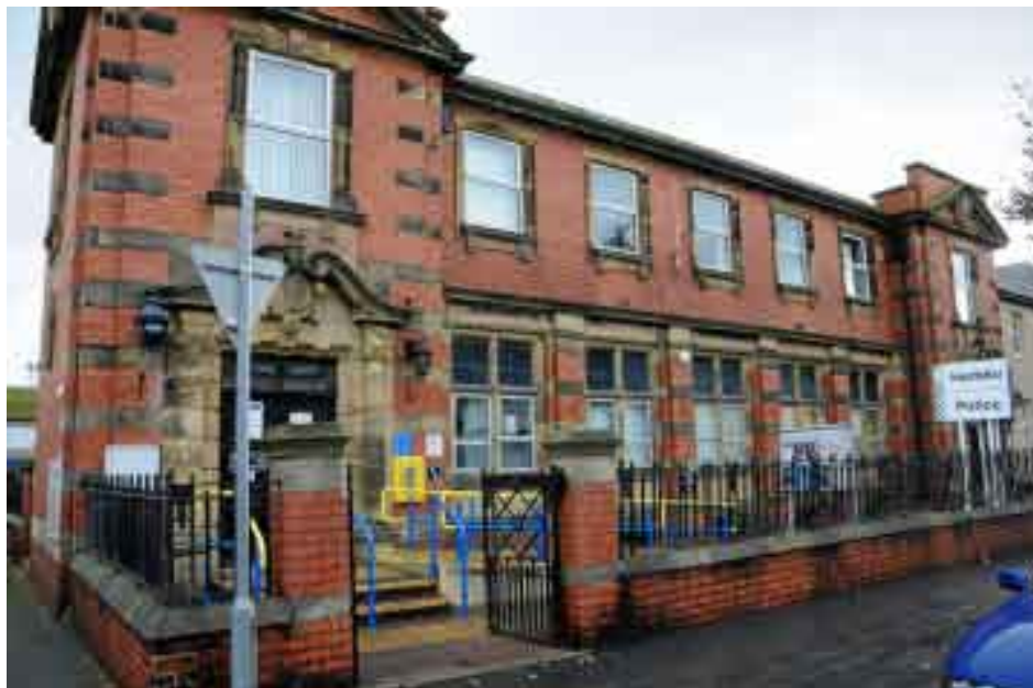
The Llandudno Police Station.