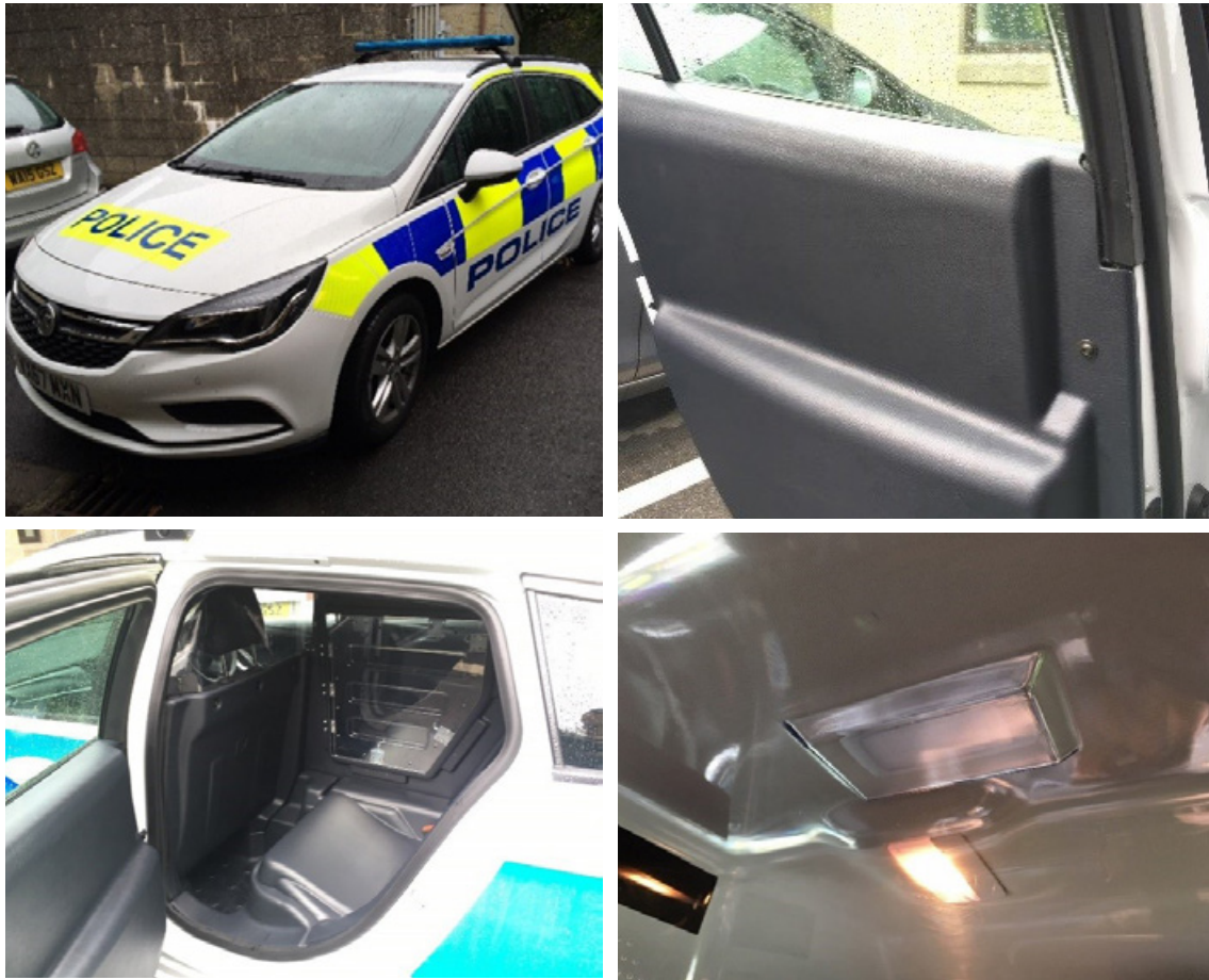
Figure 4.2 - Bubble car solution

North Wales Police deploy these bubble cars as its entire fleet of patrol cars, and has done so for many years. Other forces, such as Hertfordshire or Avon and Somerset, deploy some bubble cars as part of a mixed fleet of patrol cars.