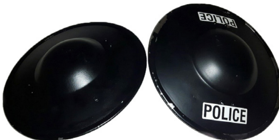
Figure 4.1 – Personal safety shield

Between April 2018 and May 2019, approximately 12,500 MPS officers attended PST, which included an input on the use of the PSS in defending against a knife-armed attacker. Feedback has yet to be analysed for the MPS’s Officer Safety Board and Self Defence, Arrest and Restraint (SDAR), but the early indications are reported to be positive.