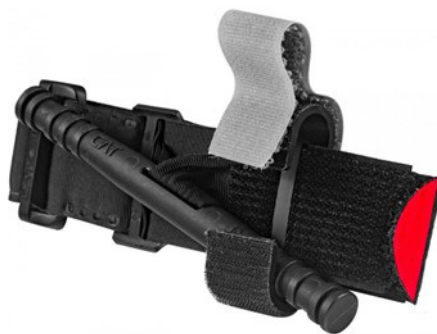
Figure 4.3 – Self-application tourniquet

The rise in knife crime and threat of terrorism leads to a risk of catastrophic bleeding to injured officers, staff and members of the public. SATs were developed by the military during the Iraq and Afghanistan conflicts, and are designed to provide a simple tourniquet that can be self-applied with a single hand. In policing, their role is two-fold: firstly, for application to casualties who are experiencing catastrophic bleeding in a limb; and secondly, for officers to self-apply to their own limbs, if they are experiencing a catastrophic bleed (self-aid).