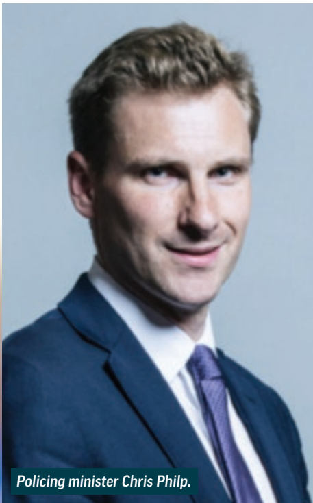
Policing minister Chris Philp.

Mr Philp said officers were not the "thought police" and that being rude or insulting should not be treated as a "police matter". He said changing Home Office counting rules on how reported incidents were logged would slash "unnecessary red tape" and free up more time to investigate crime.