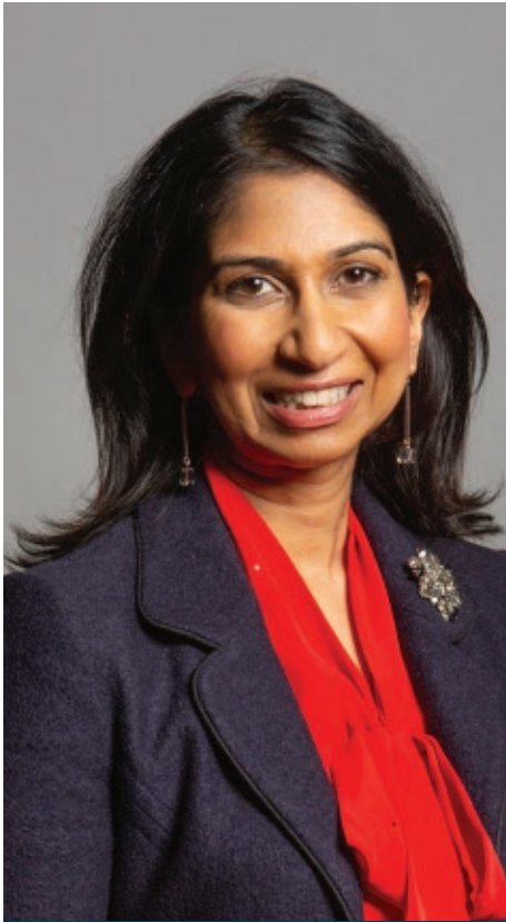
Home Secretary Suella Braverman.

He said: "The reality is, considering population growth of more than four million since 2010, even with an uplift of 20,000 officers, we will have fewer officers on the streets than we had a decade ago.