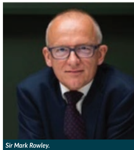
Sir Mark Rowley.

“There is no way to retain officers and avoid the 'revolving door' effect unless police officers are properly paid. The job is stressful enough without the added pressure of money worries.