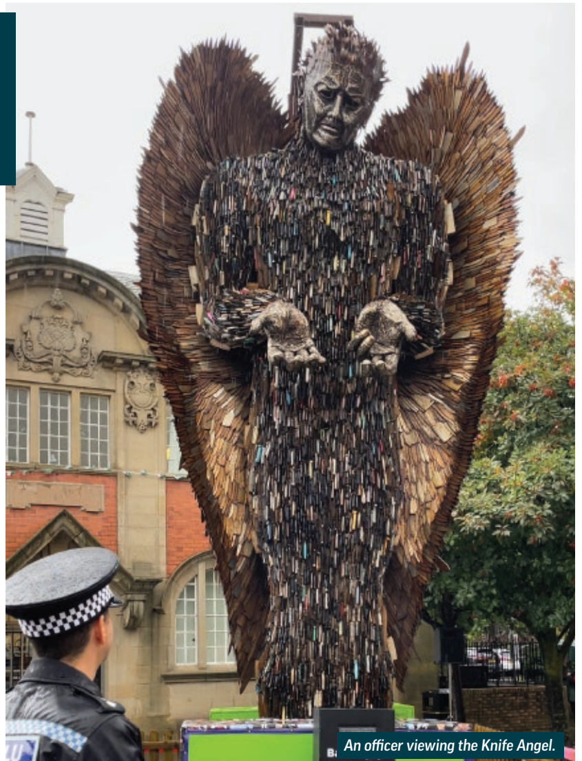
An officer viewing the Knife Angel.

"We hope that as many people as possible visited the Knife Angel while it was here in Gwent, that it opened up conversations, and that it makes people think again about carrying a weapon."