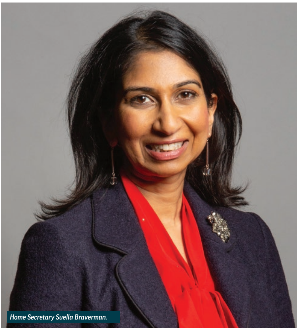
Home Secretary Suella Braveman.

She said: "I have asked the college to build on their work by considering options for a new non-degree entry route, to deliver officers of the