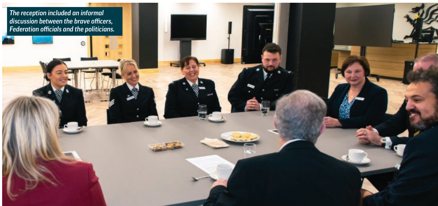
The reception included an informal discussion between the brave officers, Federation officials and the politicians.

“ I was overwhelmed with how lovely it was, meeting the First Minister who is such a lovely man. We were all treated so well once again and are very grateful. ”