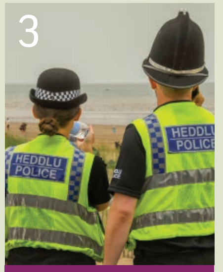
Officers given seven per cent pay rise