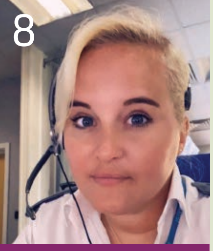
Force becomes an official endometriosis friendly organisation

9 Fed welcomes appointment of Police Covenant chief medical officer