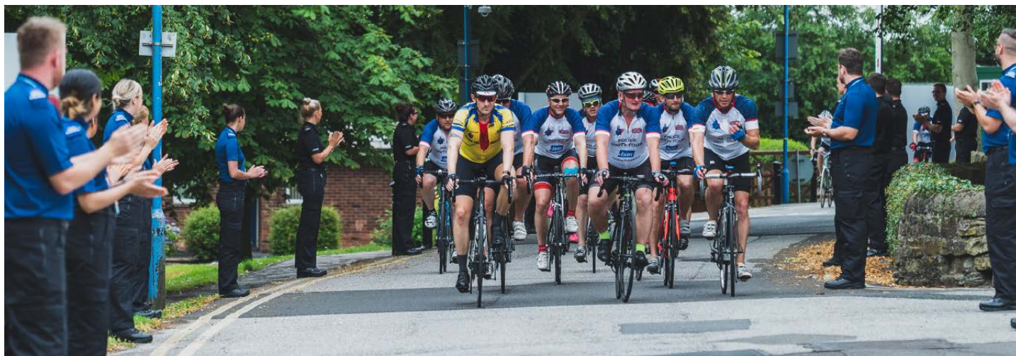
The Derbyshire team leads the PUT into headquarters.

T he Derbyshire Police Unity Tour riders, along with the other cyclists taking part in the event, all wore a wristband dedicated to a fallen officer which, where possible, was presented to their family members at the end of the ride.