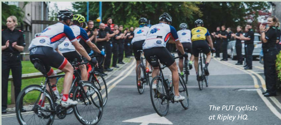
The PUT cyclists at Ripley HQ.