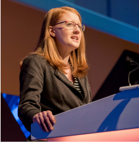
Holly Lynch, Halifax MP.

L about MP for Halifax Holly Lynch was one of three speakers to talk about their careers in the 'Women standing shoulder to shoulder' break-out session on the opening day of conference.